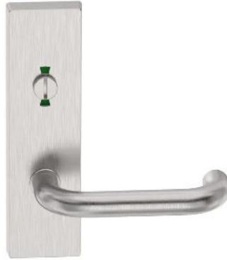
Entro Lever w/ Ind. Release LVENPT3910SS