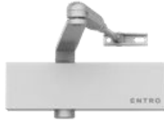
Entro Door Closer CLENPT0653SL