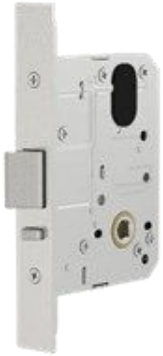
Entro Mortice Lock LKENPT0160SS