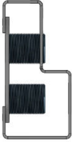
Fortress 100 Box Frame