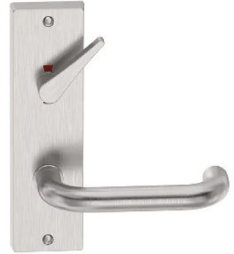
Entro Lever w/ Ind. Turn LVENPT3810SS