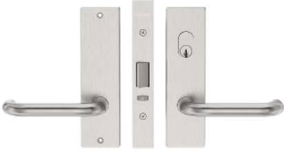
Entro Classroom Kit ESEBPT0121SS

Note: Parkwood stock a much wider range of hardware, other options available on request.